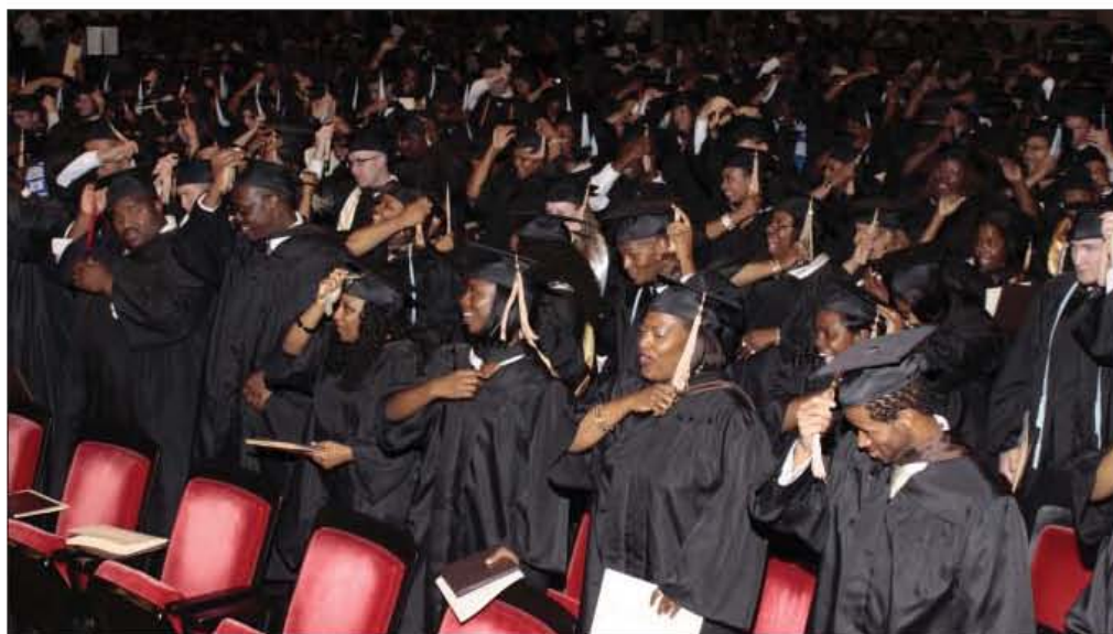
After receiving their diplomas, the 2009-2010 Harris-Stowe graduates enthusiastically "turn" their tassels from the right to the left to symbolize that they have officially graduated.