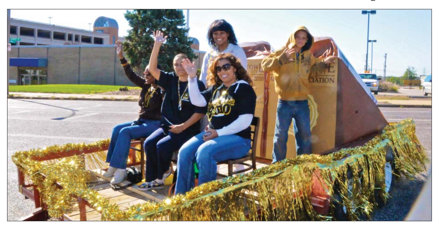
The Harris-Stowe Alumni Association has been a long-time participant of its alma mater's Homecoming parade, but this is the first time in many years that the association has entered a float in the parade. In keeping with the Homecoming theme "Love, Liberty, and Legacy — Always Remembered, Never Forgotten," the association created an oversized Harris-Stowe yearbook on the back of the float, which is open to reveal actual photos of former Harris-Stowe classes.