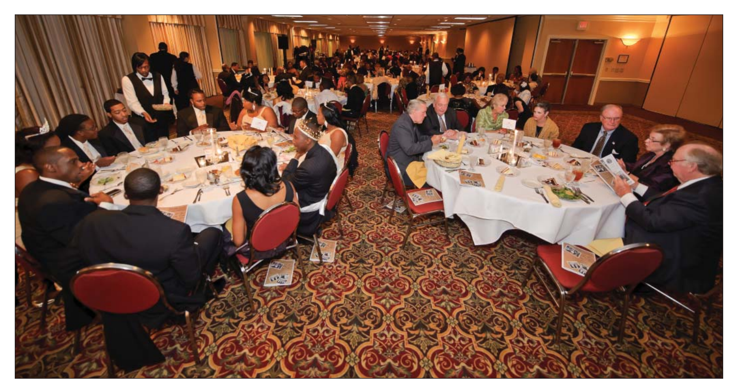
The Crowne Plaza Hotel was packed as nearly 200 Harris-Stowe alumni, faculty, staff, students and friends attended the Gold Gala.