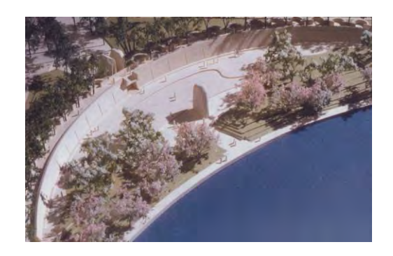
National Memorial Site