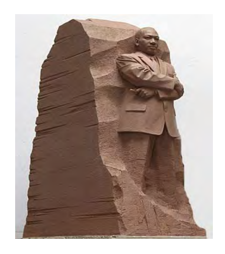
Dr. King Monument