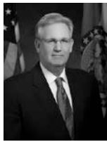
The Honorable Jeremiah W. (Jay) Nixon Governor