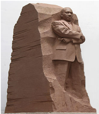
Dr. King Monument