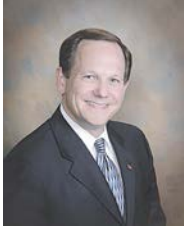
Francis G. Slay Mayor, City of St. Louis