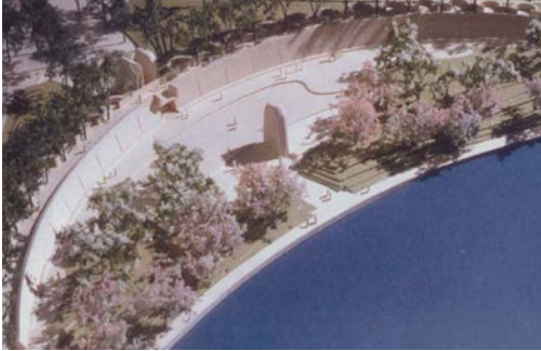
National Memorial Site