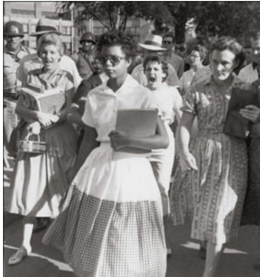
Elizabeth Eckford, Little Rock Nine