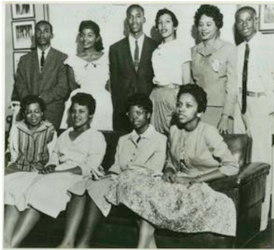
The Little Rock Nine