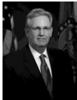
The Honorable Jeremiah W. (Jay) Nixon Governor