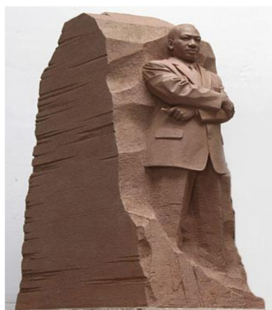
Dr. King Monument