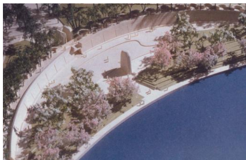
National Memorial Site