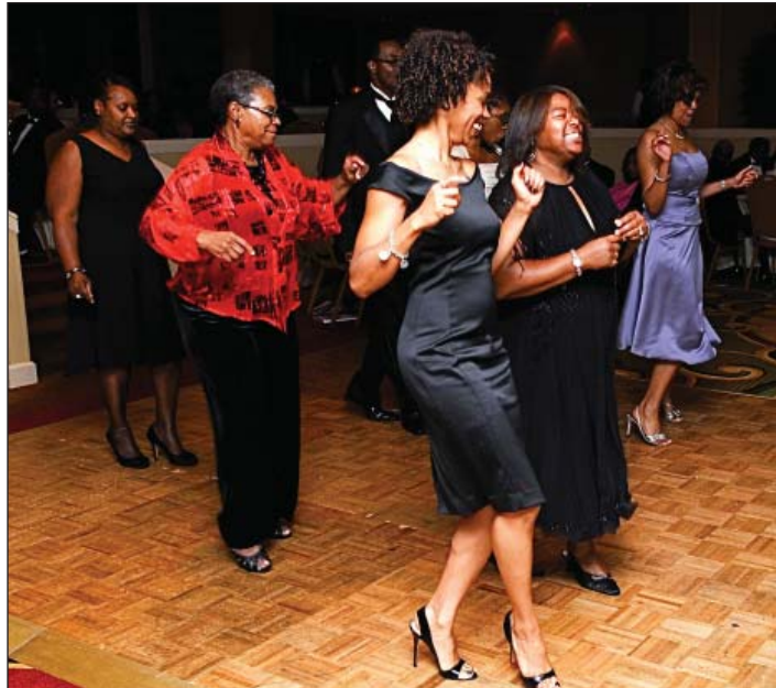
HSSU alumni and staff break it down on the dance floor at the 2008 Gold Gala. This year's event is sure to be just as thrilling!

Homecoming 2009 officially kicks off on October 2, with the annual kick-off pep rally in the Emerson Performance Center. Just this year, the HSSU Drumline expanded to form the HSSU Marching Hornets, a complete marching band, and they're sure to make a grand entrance. Of course, the HSSU Marching Hornets would not be complete without the Honeycomb dance line and the Golden Sting flag corp. Harris-Stowe's seven athletic teams, Men's and Women's Soccer, Men's and Women's Basketball, Men's Baseball,