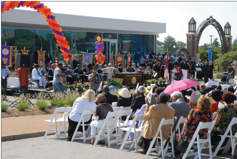
A packed audience gathers on Compton Avenue and watches the historic grand opening of the William L. Clay Sr. Early Childhood Development/Parenting Education Center.

In addition to serving young children and HSSU Early Childhood Education majors, the $17.5 million facility also provides young parents an outlet for reading or borrowing research-based materials from the center’s library to increase their knowledge and enhance their parenting skills. Early childhood education employees can utilize the Observation Room and attend workshops and seminars.